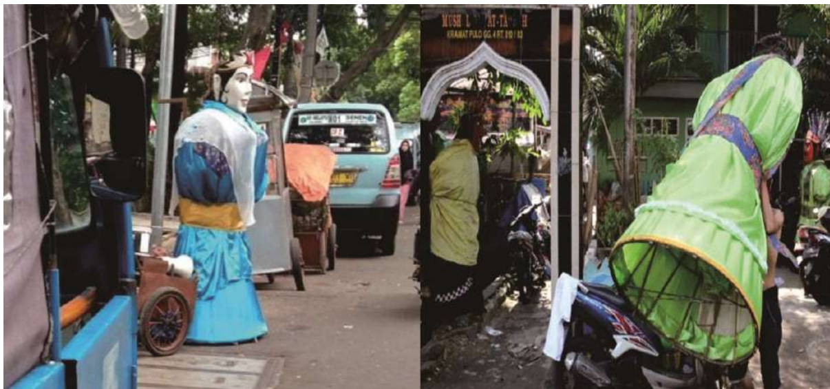
Figure 4. Rental Activities Ondel-Ondel (Personal Documentation, 2019)

port and a flash drive containing Betawi songs. The studio manager or entrepreneur of ondel-ondel also wants to empower teenagers to have more productive activities. The ondel-ondel used to parade for busking on the streets differs from the ondel-ondel for performances. The difference lies in the size, accessories, and decoration of the ondel-ondel.