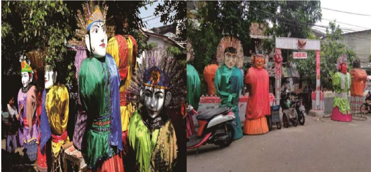
Figure 1. Ondel-Ondel Village in Kramat Pulo, Central Jakarta (Personal Documentation, 2019)

Everyone who visits this village will feel welcomed by ondel-ondel, whose positions are to the left and right of the Kramat Pulo Gate. The gate made of bamboo also bears the words Ondel-Ondel Village. Visitors to this village can see firsthand the activities of local people who produce ondel-ondel. The craftsmen also still produce ondel-ondel traditionally. So that visitors can still observe the process of cutting bamboo, arranging frames, making masks, and decorating ondel-ondel. The process that takes the longest is cutting bamboo. The craftsmen must scrub the pieces, so there are no sharp sides on the bamboo. Therefore, everyone who parades ondel-ondel will not experience an accident when busking on the streets.