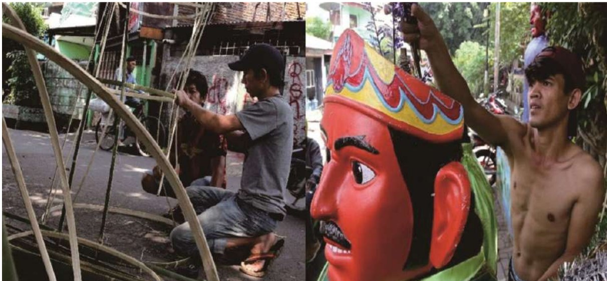
Figure 2. Ondel-Ondel Production Activities in Kramat Pulo, Central Jakarta (Personal Documentation, 2019)

Everyone who visits this village will feel welcomed by ondel-ondel, whose positions are to the left and right of the Kramat Pulo Gate. The gate made of bamboo also bears the words Ondel-Ondel Village. Visitors to this village can see firsthand the activities of local people who produce ondel-ondel. The craftsmen also still produce ondel-ondel traditionally. So that visitors can still observe the process of cutting bamboo, arranging frames, making masks, and decorating ondel-ondel. The process that takes the longest is cutting bamboo. The craftsmen must scrub the pieces, so there are no sharp sides on the bamboo. Therefore, everyone who parades ondel-ondel will not experience an accident when busking on the streets.