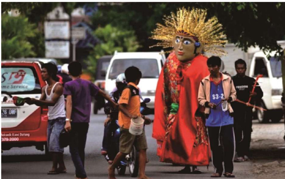
Figure 5. Ondel-Ondel Busking Activities (Personal Documentation, 2019)

Apart from the studio owners, several local people who live in Kramat Pulo also take on the role of ondel-ondel entrepreneurs. Umi stated that: 8